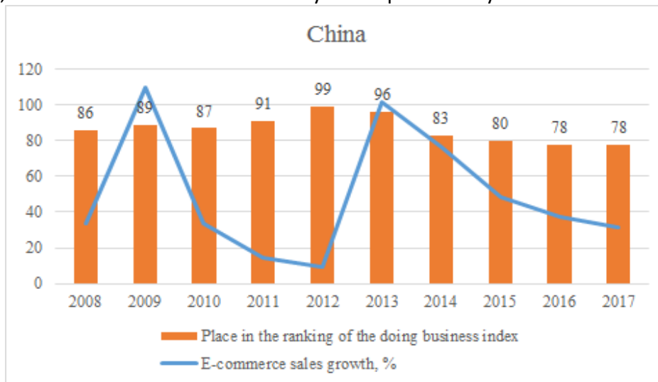
Figure 3 – Comparison of country's place in the ranking of ease doing business and e-commerce growth rate in China

according to which the slowdown in sales growth is accompanied by a further fall of the country in the rating (2012-2013 and 2015-2016 years) and vice versa - 2016-2017 years. 2009-2010 do not reflect the main trend since it is post-crisis years.