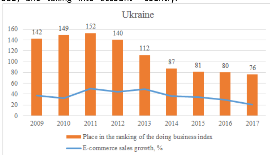
Figure 5 – Comparison of country's place in the ranking of ease doing business and e-commerce growth rate in Ukraine

changes in the hryvnia exchange rate to the US dollar during the analyzed period, sales growth rates in hryvnia equivalent are much more rapid. This confirms the hypothesis of the between the development of the e-commerce and simplification of business processes in the country.